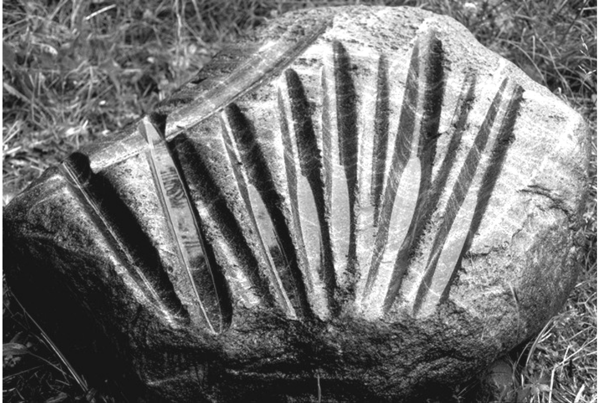
Fig. 1. A granite boulder with 11 grooves lifted up from a river in the parish of Hørsne.